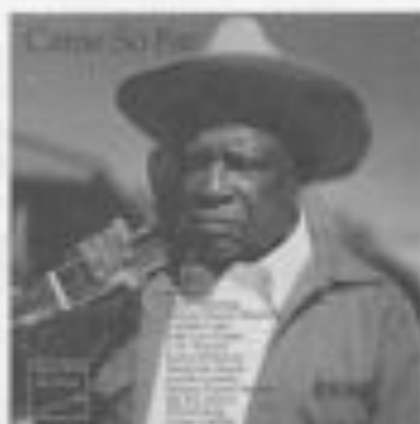
Came So Far MMCD 1294