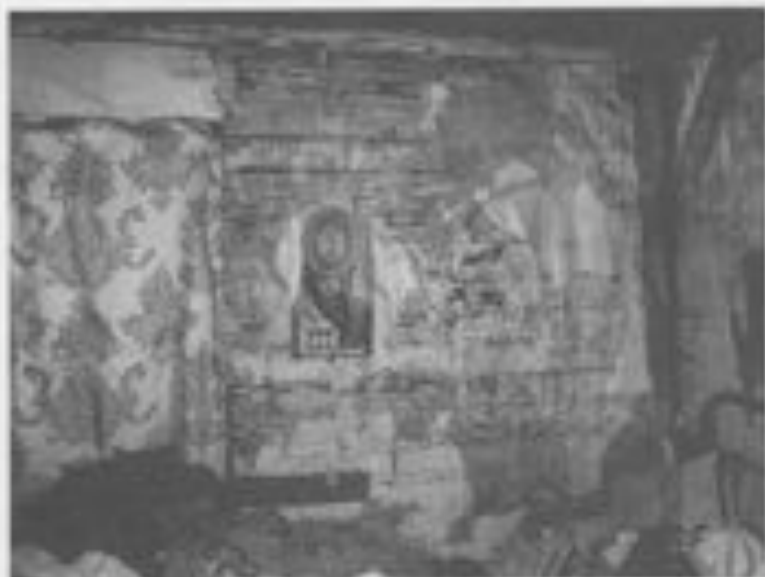
Society Hill, Alabama, March 1995