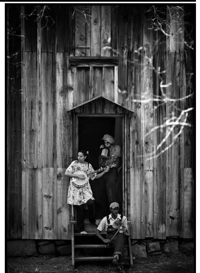
The Carolina Chocolate Drops are making history!