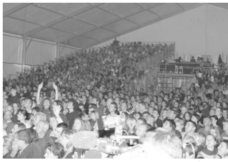
The crowd for the MM show in France