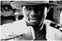
Robert Randolph will be a part of the 2nd Annual Congressional Blues Fest