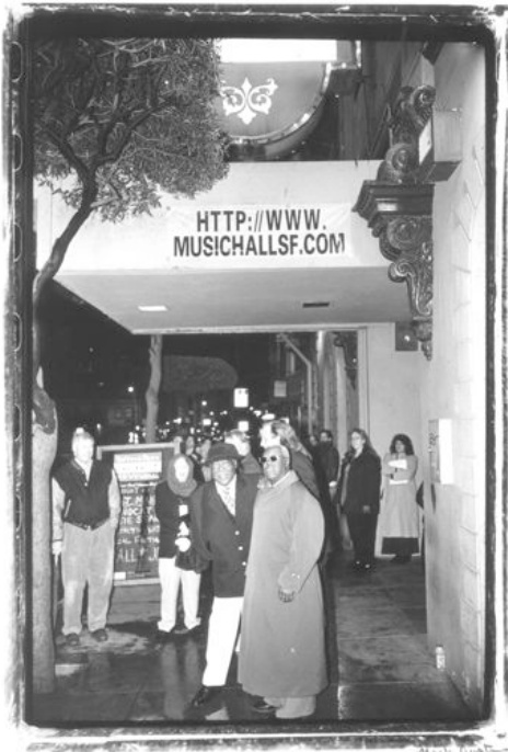
Great American Music Hall, San Francisco, CA