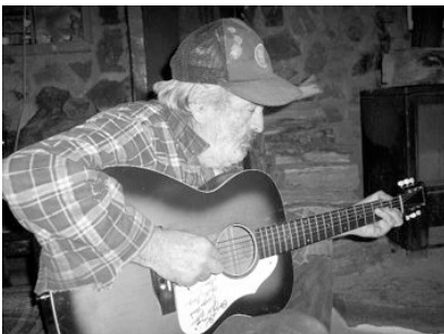
Cast King

We are proud to welcome a new Music Maker Recipient, Cast King .