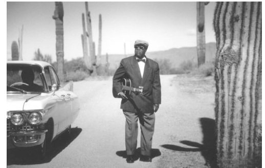
Phoenix, AZ ©Markow