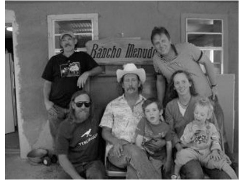
Rank Strangers and family