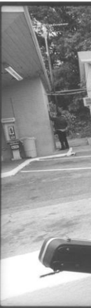
Greyhound bus station