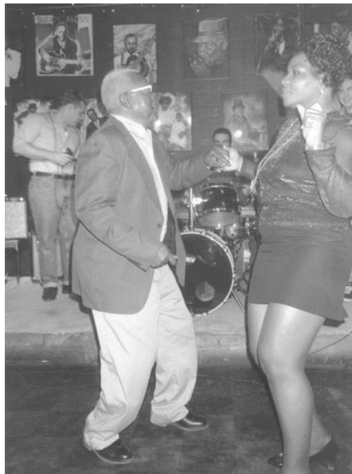
at Northside Tavern, Atlanta, GA