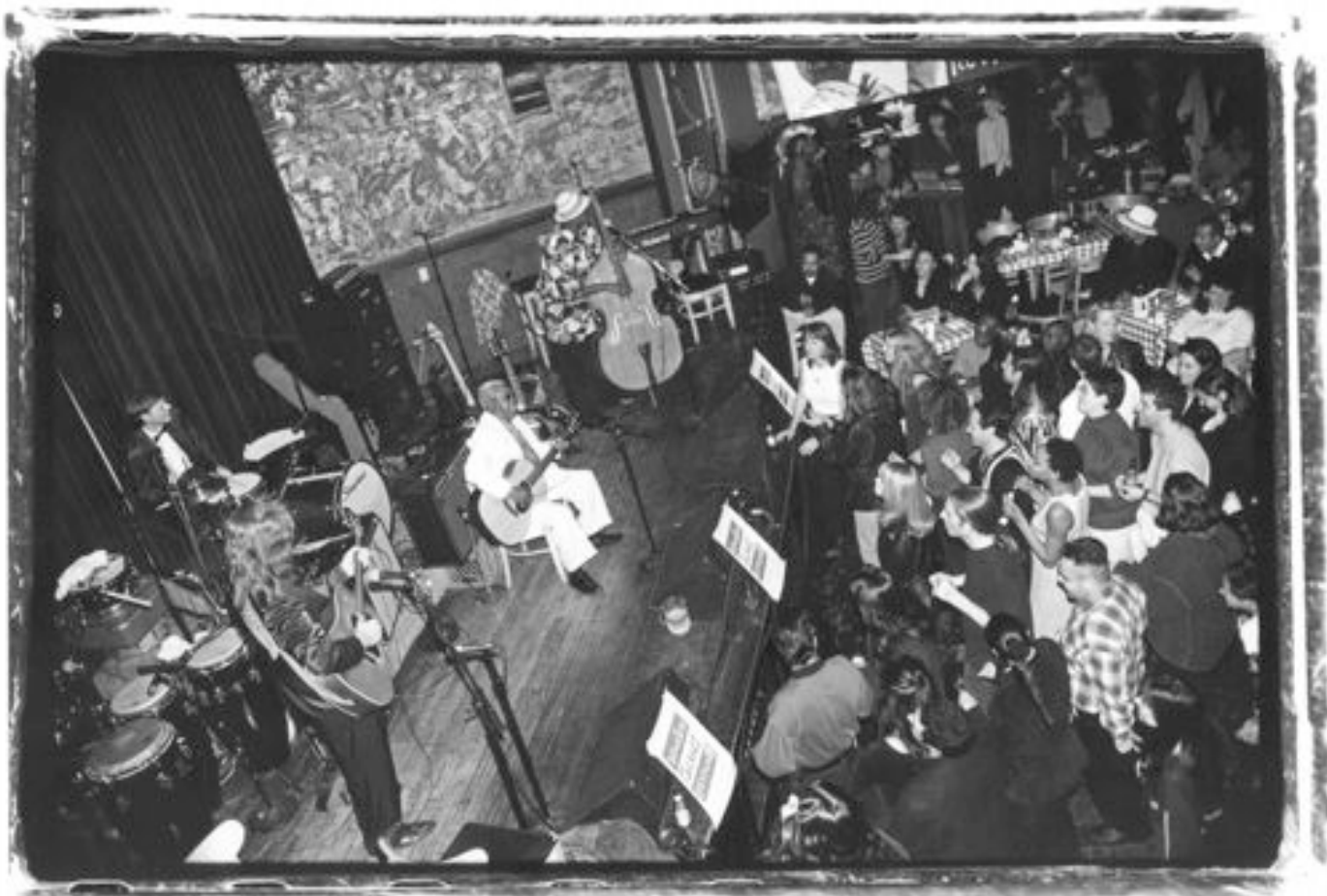
Great American Music Hall, CA with Taj Mahal