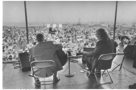
Newport R&B Festival