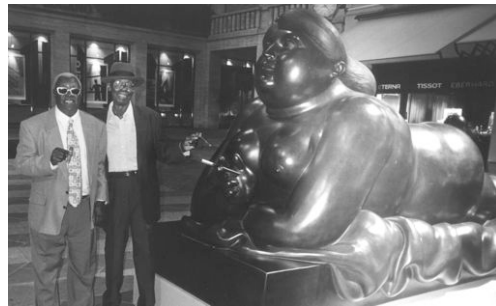
with Pinetop Perkins, Switzerland